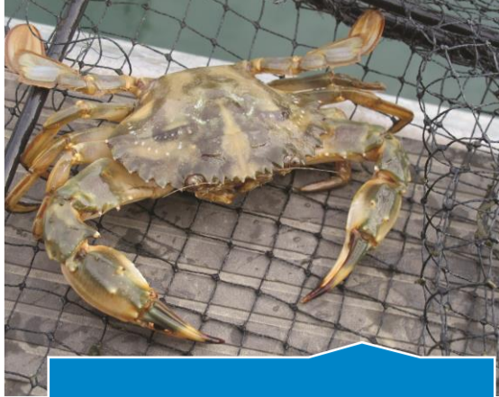
Asian Paddle Crab