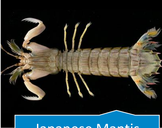
Japanese Mantis Shrimp