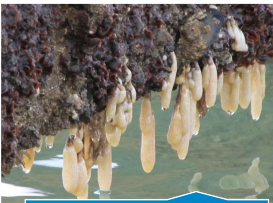
Australian Droplet Tunicate